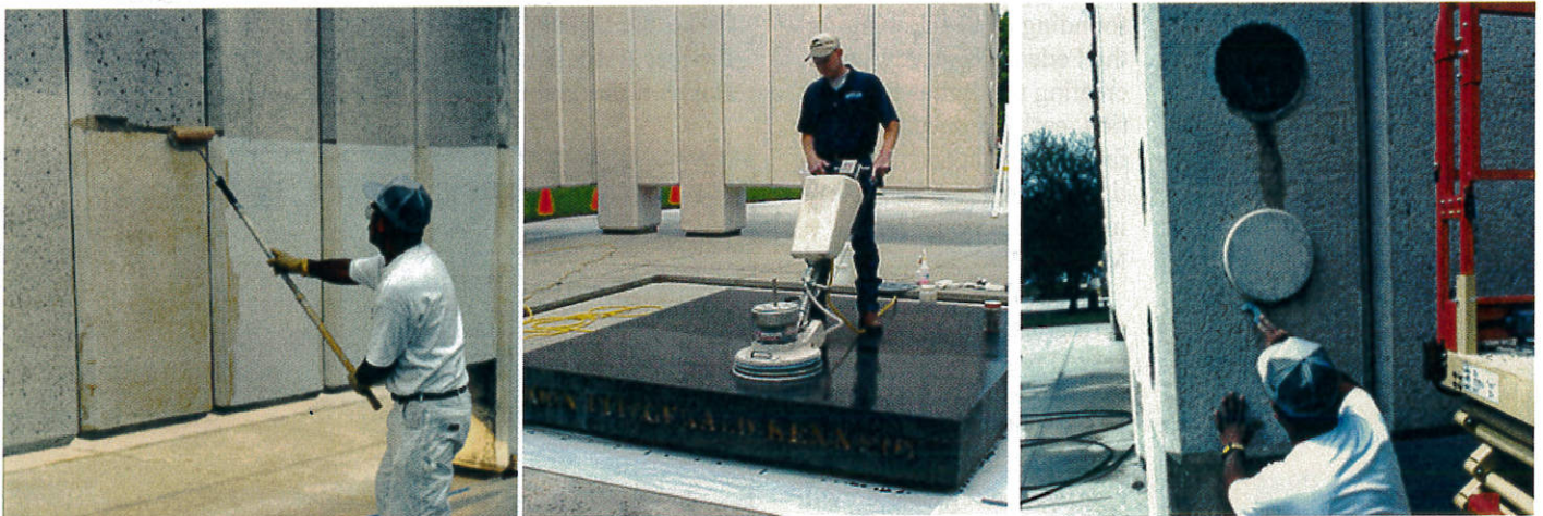
Scenes from the restoration of the Kennedy Memorial.