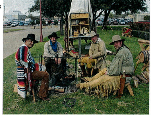
Members of the Texana Living History Association recreate a chuckwagon scene from early Texas.

Other exhibitors included the Dallas Historical Society, African American Museum, United Daughters of the Confederacy, Daughters of the Republic of Texas/Children of the Republic of Texas, Buffalo Soldiers, 9 th Texas Infantry (Civil War), 2 nd Texas Volunteers (Spanish American War), Dallas Parks Foundation, Dallas Fire Fighters Museum, Blacksmiths, and Waxahachie Free Trappers.