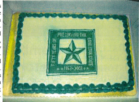
A cake commemorated the THC's 50th Anniversary

Participants were given the opportunity to tour the Denton County Court House on Square Museum and to enjoy the shops around the square. Many shop owners have wholeheartedly participated in the Denton Main Street