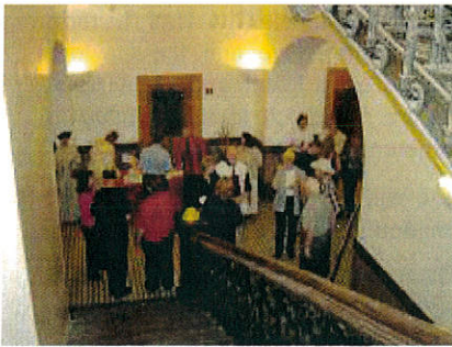
The attendees enjoyed food and entertainment at the reception.

Museum, Preservation Dallas, and the Sixth Floor Museum.