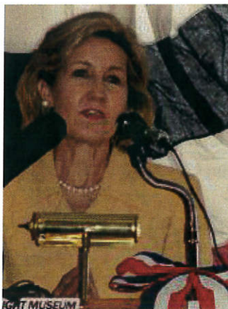
Senator Kay Bailey Hutchison spoke to the attendees.

parcel of land south of Bachman Lake. The property had been purchased with funds secured by a group of businessmen who believed that aviation could overcome Dallas's lack of a seaport.