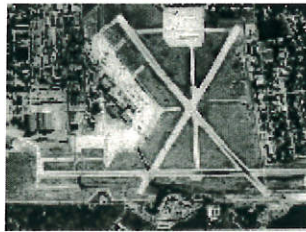
Love Field circa 1940.

Aviation formally came to Dallas in November of 1917 when the Army Signal Corp opened a flying school on a