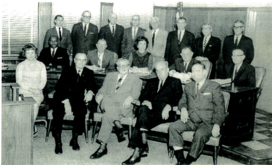
The Grand Jury, convened in October 1963, that later indicted Jack Ruby of the shooting of Lee Harvey Oswald.