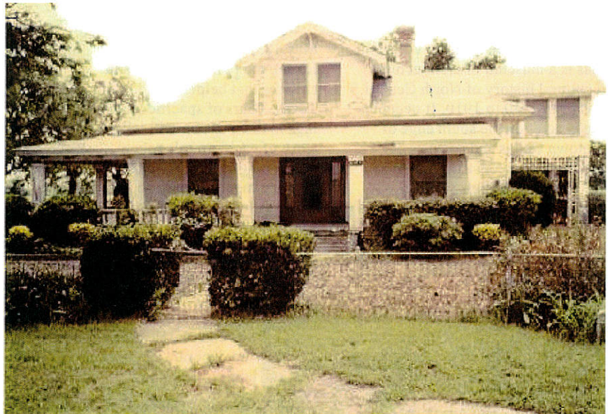
The Coyle House

As a result project planners recommended moving the house and outbuildings to an appropriate location for its preservation as a community facility.