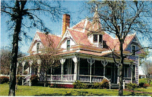
There are nearly 40 historic structures in the park.

Old City Park: The Historic village of Dallas is a museum of architectural and cultural history of North Central Texas from 1840 to 1910. It occupies thirteen acres on the south edge of downtown Dallas and consists of nearly forty historic structures. It is open Tuesday through Sunday.