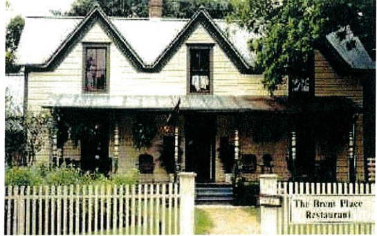
The Brent Place Restaurant at Old City Park reopened March 15. Lunch is served Tuesday through Saturday from 11 to 2.

On July 4 the park will celebrate an old fashioned Fourth