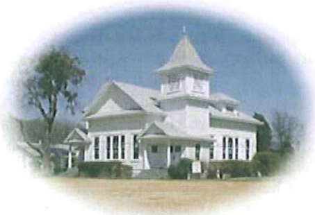
The Wheatland Church, which was completed in 1859, is an example of Prairie Style architecture.

Episcopal Church South at Wheatland also conveyed land that year. The Wheatland Cemetery Association, which family members of the interred organized in 1908, continues to maintain the burial ground.