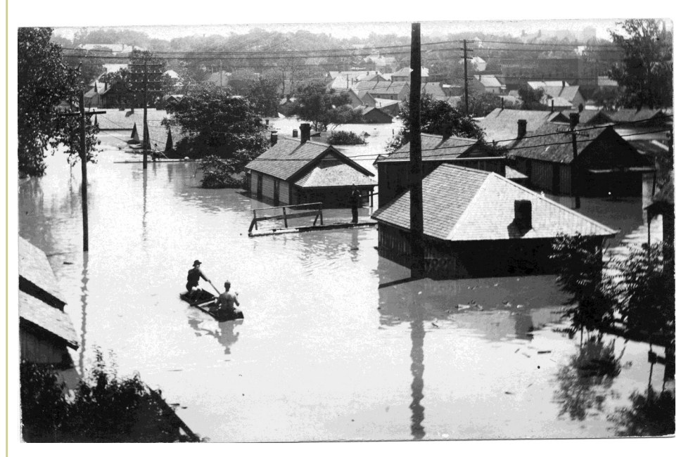
North Dallas near McKinney Street during the 1908 flood.

The Trinity River Flood of 1908 was Dallas' greatest natural disaster. The city was isolated from the rest of the nation -- and the world -- for more than four days. In the days before FEMA, Dallas had to recover on its own, and a major result was that Dallas got its first city plan, the plan that gave it so many of the features recognizable and important today.