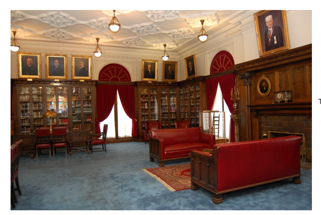
The Scottish Rite Cathedral Library

The Cathedral, now more than 100 years old, still serves the mission of the Scottish Rite of Free Masonry, hosting its many meetings and ceremonies. The building is also a center for private events, and is the site of numerous weddings and banquets. In 1978 it was recognized as a City of Dallas Landmark, and in 1980 it received a Recorded Texas Historic Landmark marker.