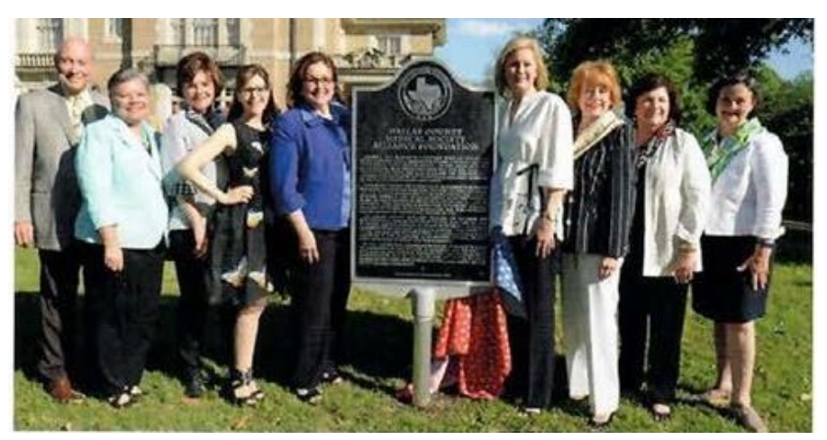
The recent dedication of the State Historical Marker for the Dallas County Medical Society Alliance.

Not surprisingly, in 2017, the Texas Historical Commission recognized the founding and the contributions of the Medical Society Alliance (as the Auxiliary is now known) with the awarding of a State Historical Marker, appropriately citing its role in creating similar organizations throughout the country and its emphasis on children, the nursing profession, and the improvement local medical facilities. of