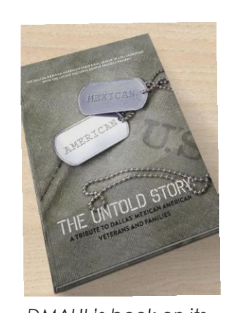
DMAHL's book on its 2015 veterans exhibit.

Its research and publication efforts have included the printing of The Untold Story: A Tribute to Dallas' Mexican American Veterans and Families , a documentation of the organization's major 2015 exhibit and the production of a map showing the location of Dallas' Mexican American barrios from 1900-1970. The map of past and present barrios is believed to be one of the most complete accounts of where Dallas Hispanics lived during much of the last century and complements DMAHL member Sol Villasana's book, Dallas' Little Mexico , which tells the story of Dallas' earliest barrio.