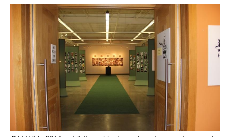
DMAHL's 2015 exhibit on Mexican American veterans at the Latino Cultural Center.