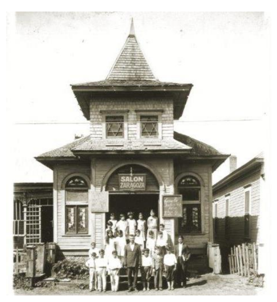
Primera Iglesia Bautista about 1919.

Not surprisingly, such activity has resulted in the organization receiving a number of awards, including the 2013 Dallas Historical Society Award for Excellence in Community Service-