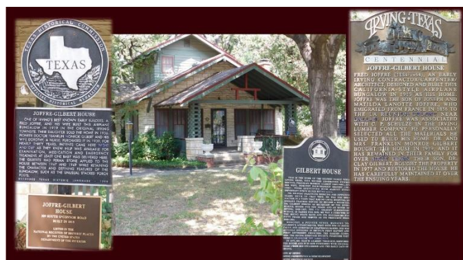
Markers—for the Joffre-Gilbert House—being where they were supposed to be.