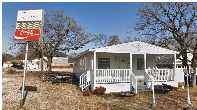
The former home of Townsell Grocery.