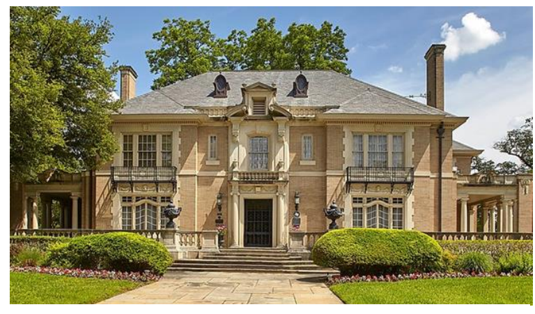
The Aldredge House at 5500 Swiss Avenue was built in 1917.

While no one has yet built a time machine that will actually allow us to return to that era, the Friends of Aldredge House and a group of dedicated actors in period costumes clearly provide us with the next best thing.