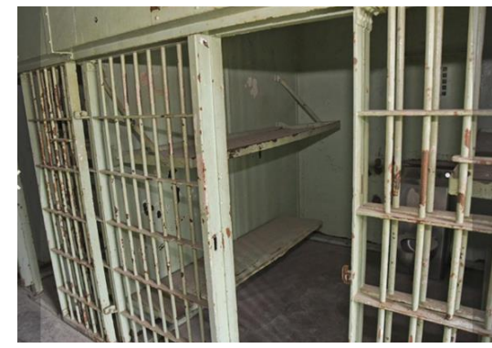
Lee Harvey Oswald's jail cell.

To support what is now the first public law school in Dallas, classrooms were created, the building's entire sixth floor was transformed into a modern law library, and the two basement-level floors were redesigned with a large state-of-the-art courtroom, law commons, and lounging areas for students.