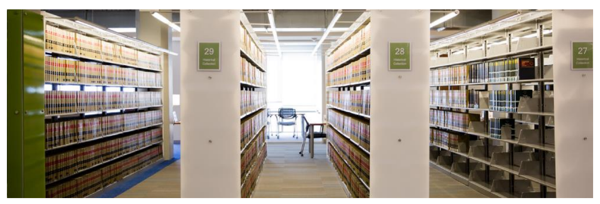
The new law library inside the Dallas Municipal Building.

With the completion of this work, the future of what was once known as "Old City Hall" appears to be as promising as its past.