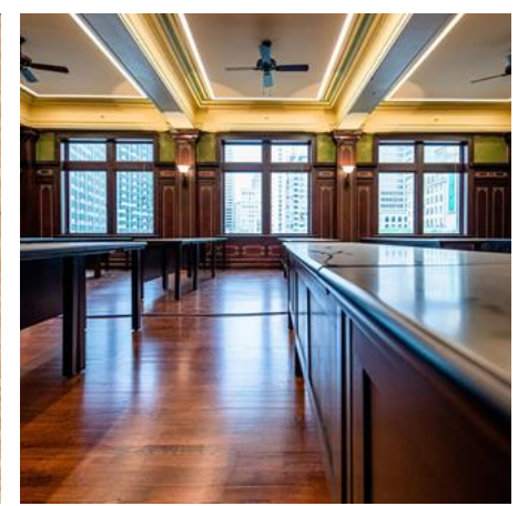
The building's restored grand staircase, the uncovered WPA-era mosaic tile, and the restored council chambers.

Many important items associated with November 1963 have also been preserved, including the row of jails cells that once held Oswald and Ruby, the mugshot wall where both men's police photos were taken, the prisoner elevator, and the captain's office were Oswald was interrogated.