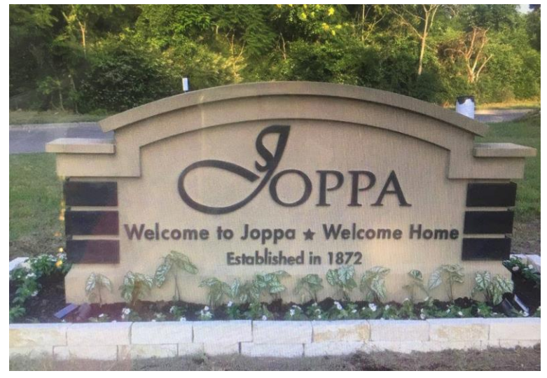
Entryway sign into the Joppa Community where the very first Juneteenth celebrations in Dallas were held.

Tucked along the banks of the Trinity River near the terrain of the Great Forest lays the historic African American, "Freedman" town, Joppa. The community is six miles, southeast of Dallas, off interstate 45, near highway 310 and Loop 12.