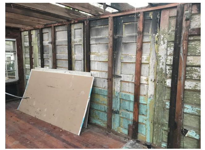
Sowers School doors were uncovered by the owner of the old Farris home in 2020.

For 80 years a school building of some type had occupied the two-acre Sowers School site, starting with a log cabin housing the first school in the 1880's. The original 2 acre site of Sowers School is now the location of Irving's Secondary Reassignment School and IISD school bus parking.