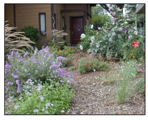
SmartScaped garden uses less water and less pesticides, providing a safe and clean place for people and animals.

A SmartScape uses less water, fertilizers and pesticides, while also attracting interesting wildlife such as hummingbirds and butterflies.