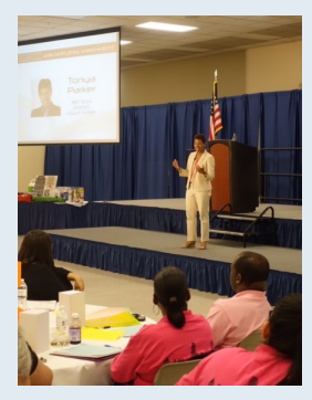
Judge Tonya Parker