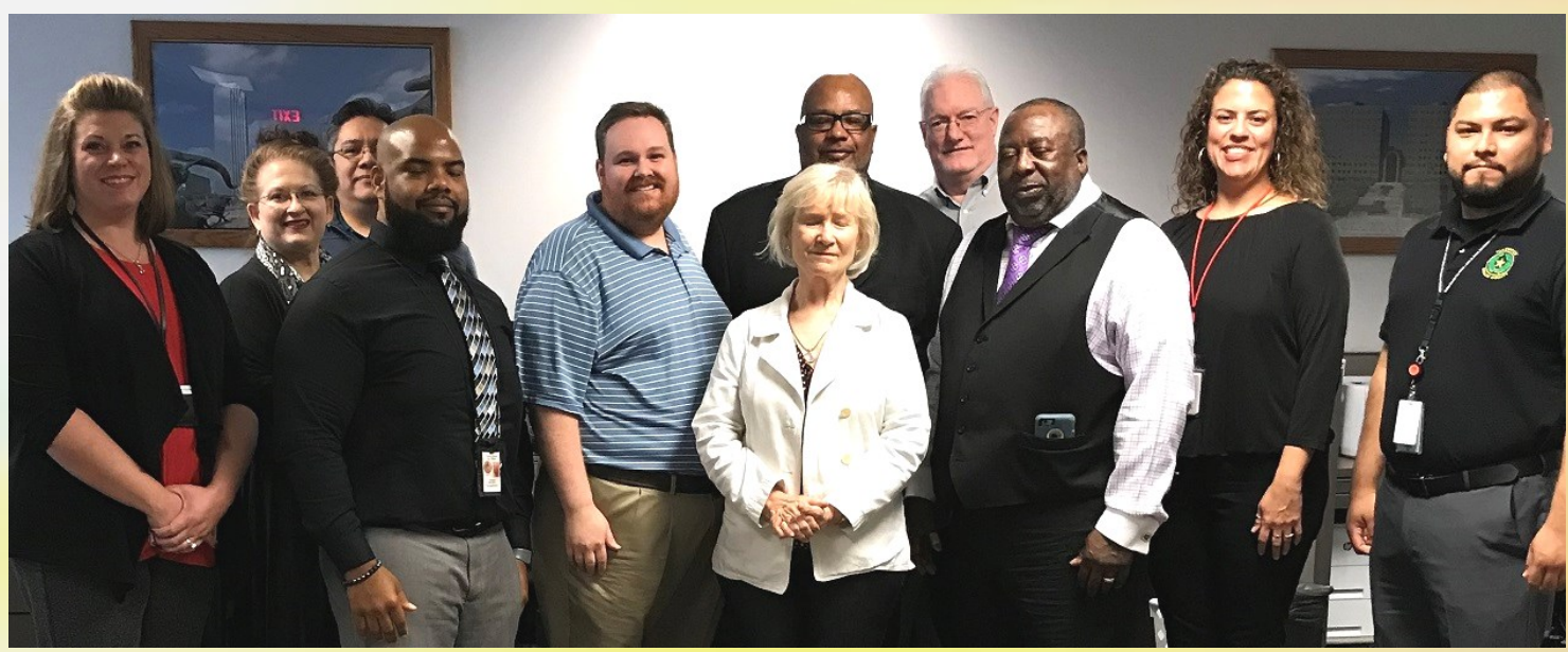
On November 6, 2017, The Travis County Tax Office came to Dallas to learn about how to implement a Dealer and Title Runner Permit Program. They took a quick tour of our offices where they learned about all our downtown divisions.