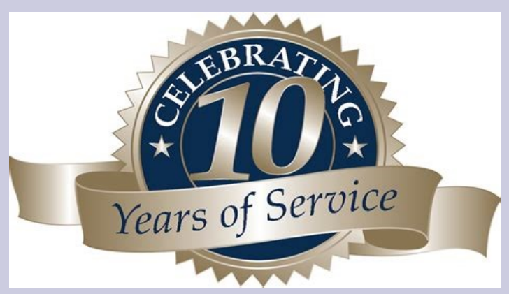
Gildradan "San" Janes