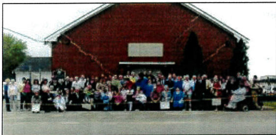
A large crowd gathered for the event.

Today, Tripp Baptist remains a vibrant part of the Sunnyvale community.