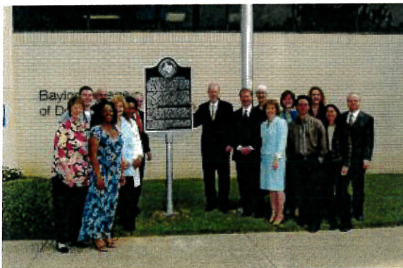
Dignitaries gather around the marker after the unveiling.