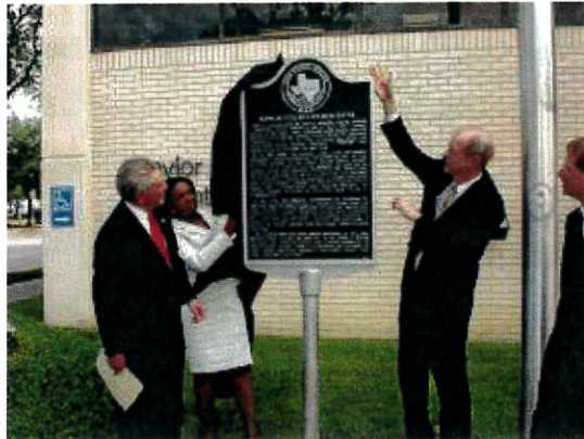
Officials from Baylor College of Dentistry unveil their marker.

At the dedication, speakers included Baylor College of Dentistry Dean Dr.