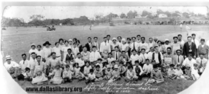
Cement company employees and community residents in 1929.

It is difficult to get to, locked behind the gates of the large AT&T facility on Cockrell Hill Road, but a request at the gate will, after a few minutes to find someone who knows what you are asking about, gain you admission to the hallowed ground of a cemetery which is the last physical vestige of an Hispanic community that thrived nearby for over forty years. The community, Cemento Grande, was the company town for Mexican immigrant laborers of Trinity Portland Cement. The cemetery commemorates the life of that community, and the hundreds of people who lived and worked there.