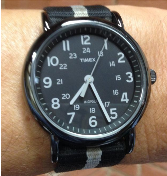
Time is counting down for marker applications. Are you ready?

The clock is now ticking for those individuals and organizations interested in applying for a Texas historical marker. Applications must electronically be submitted to the Dallas County Historical Commission no later than October 31 for them to be considered during the State's current application cycle.