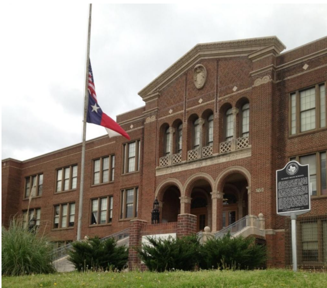
Sunset High School

Now over ninety years old—and the sixth-oldest high school in Dallas, Sunset High School has recently been designated as both a Recorded Texas Historic Landmark by the State of Texas and as a City Landmark by the City of Dallas.