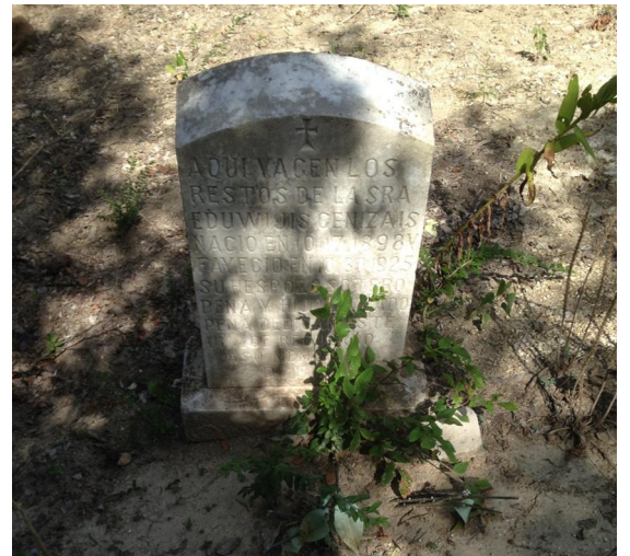
A tombstone in El Camposanto de Cemento Grande

There is also a Texas Historical Marker and a striking stone memorial to those from the community, almost all of Mexican birth or Hispanic descent, who served this country in war, particularly World War II. While Cemento Grande itself is no more, El Camposanto de Cemento Grande remains as a reminder of the community that once was and serves as a tribute to the lives that were lived there.