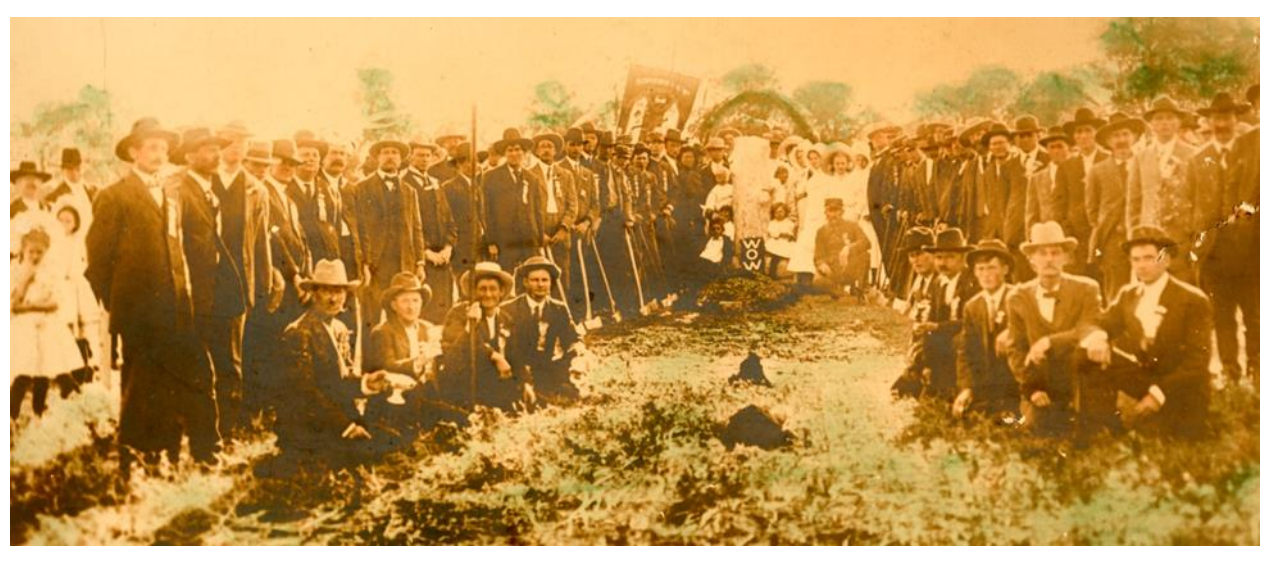
The 1908 burial of a member of the Woodmen of the World.

We see that people joined organizations like the Masons and the Woodmen, and we see that residents served during World War I, World War II, Korea, and Viet Nam.