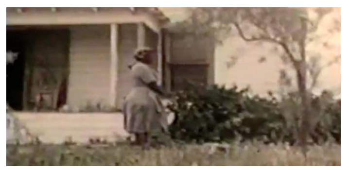
Little Egypt on its last day in 1962.

The man told him he remembered it well. "Oh, it was a black community. They all moved out on the same day back in the early sixties. It was called Little Egypt. We didn't go up that way much."