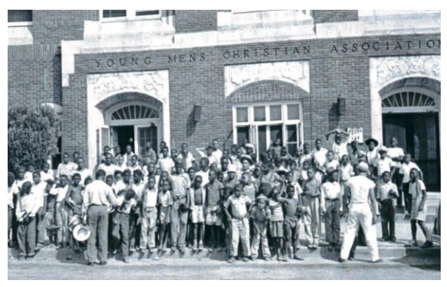
The DBDT's present home was once the Moorland YMCA, the social center for many of Dallas' African Americans.

In 2008, DBDT's tie to history was further strengthened when the building that had originally been the Moorland YMCA became the permanent home for DBDT's rehearsal studios, training classrooms, and administrative offices. Moving to the Moorland YMCA was particularly symbolic and poignant as the Moorland YMCA had been the first "Y" constructed in the southwest for African Americans, and in a city that once offered few places outside of church for blacks to congregate, the Moorland YMCA was where Dallas African Americans could gather and socialize—it was where proms were held, clubs and organizations met, and school basketball games were played.