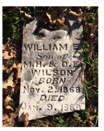
One of the earliest burials in the cemetery. Also an example of how high the infant mortality rate once was.

Although the Sowers community no longer exists, the Sowers Cemetery continues to tell us much about the people who once lived in the area. We get a sobering reminder of how high the infant mortality rate once was. There are dozens of graves of children who died either within days of being born or before their first birthday. There are also a number of graves of women who died in their thirties, presumably because of child birth complications. It is also especially sobering because this did not necessarily happen in the days of when the community was still "on the prairie." One sees these unfortunate deaths occurring up until about 1940, and we see how they sometimes occurred several times within a family and across generations.