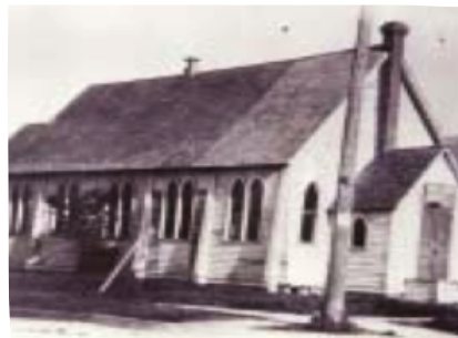
The original Christ Church

The original church was constructed on the southeast corner of Ninth Street and Marsalis Avenue in Oak Cliff, overlooking the Trinity River. The church was conveniently located near the streetcar line providing easy transportation for parishioners.