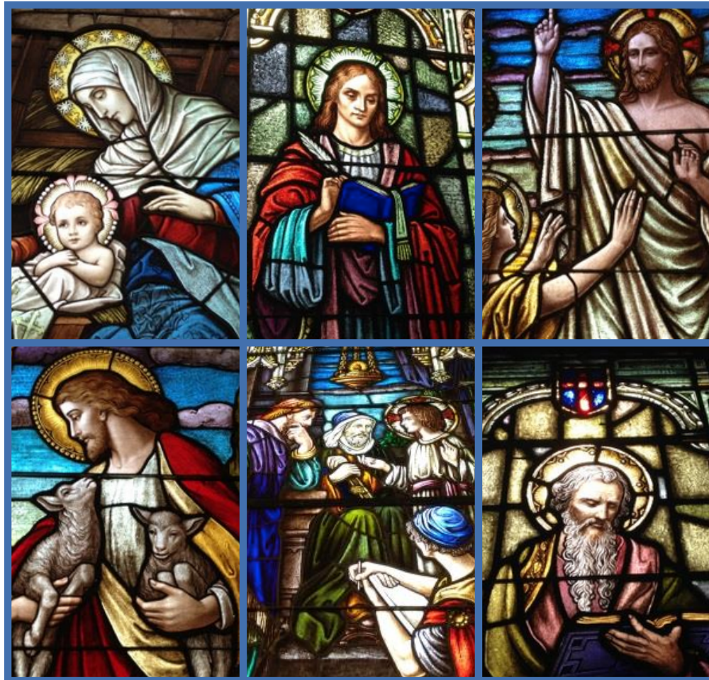
Highlights from Christ Church's stained glass art.