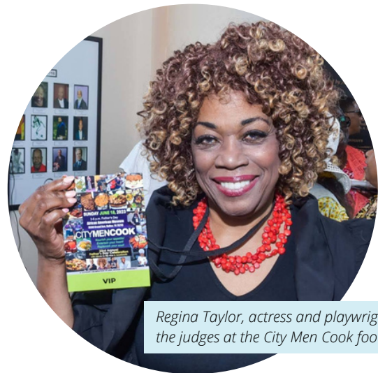
Regina Taylor, actress and playwright, was one of the judges at the City Men Cook food competition.

The African American Museum offers year around activities for a wide variety of audiences. National exhibits, art exhibits and youth activities have found a home at the museum.