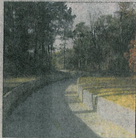
Kiestwood Trail runs along Kiest Park at Ruggest Drive.

Wiley Price and his staff initiated the Kiestwood Trail, the longest trail in the southwestern part of Dallas.