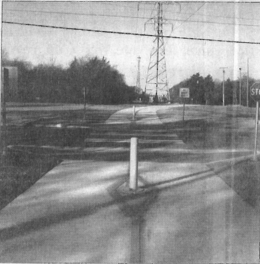
Kiestwood Trail runs along Rivinia Drive. Kimball High School is in the background.