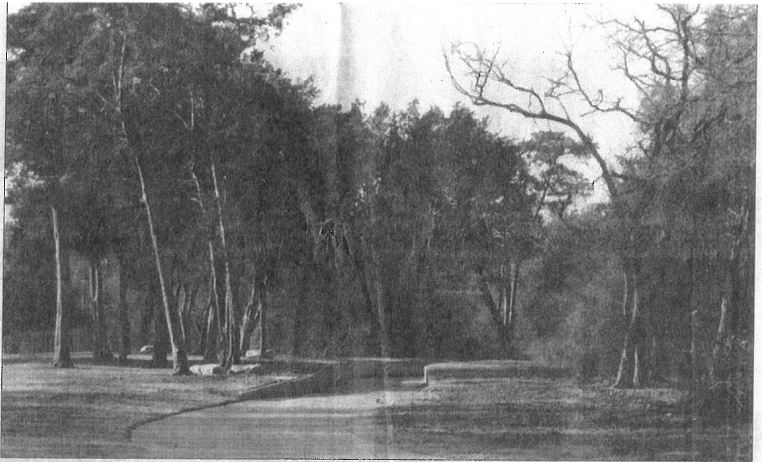
Kiestwood Trail at Kiest Park South.