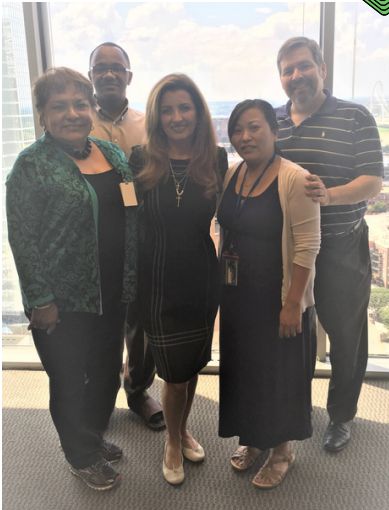
Commissioner Garcia stops by the Treasurer's Office