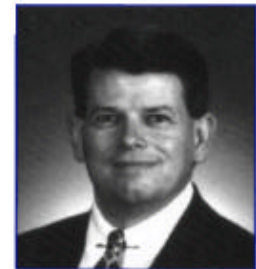
Commissioner, Precinct #2