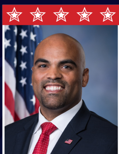
COLLIN ALLRED Congressman