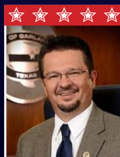
MR. SCOTT LEMAY City of Garland Mayor