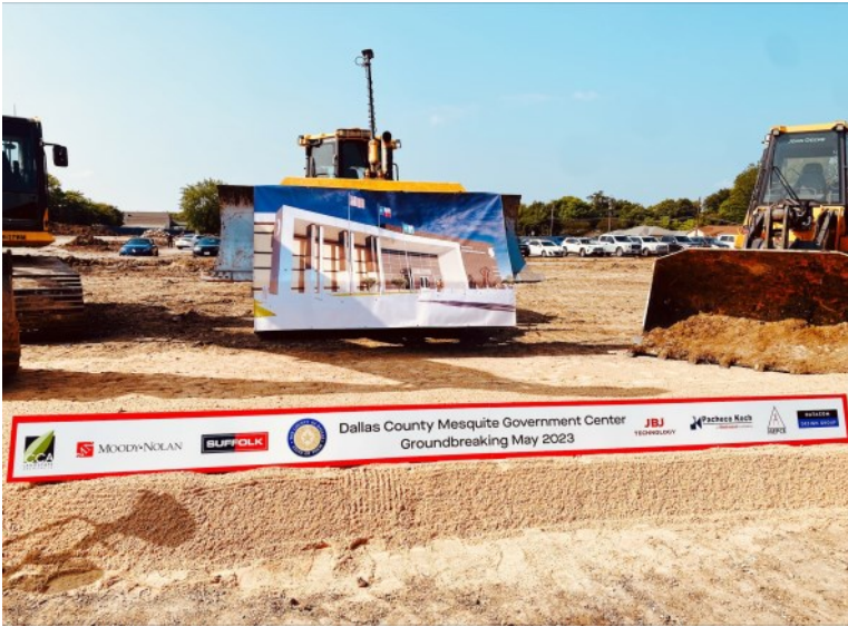
Left: Dallas County Groundbreaking Ceremony of the Mesquite Government Center.