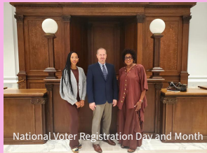
National Voter Registration Day and Month