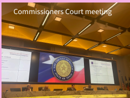
Commissioners Court meeting