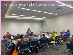
Dallas Historical Commission meeting