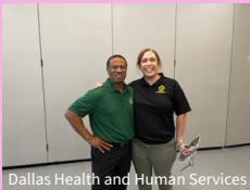
Dallas Health and Human Services