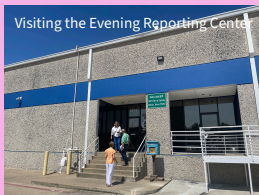
Visiting the Evening Reporting Center