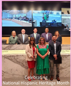
Celebrating National Hispanic Heritage Month