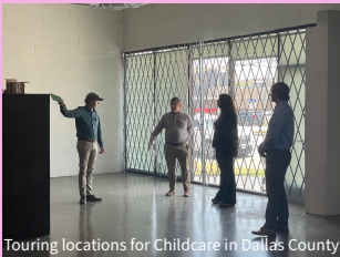
Touring locations for Childcare in Dallas County

Contact us District2Office @dallascounty.org