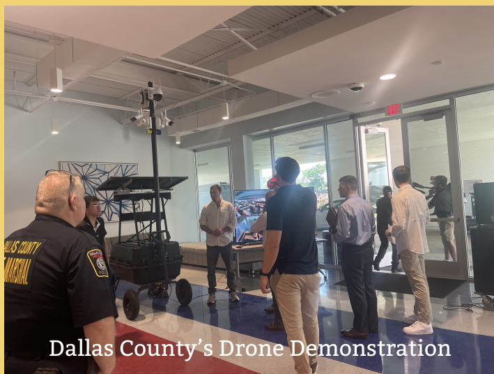
Dallas County's Drone Demonstration