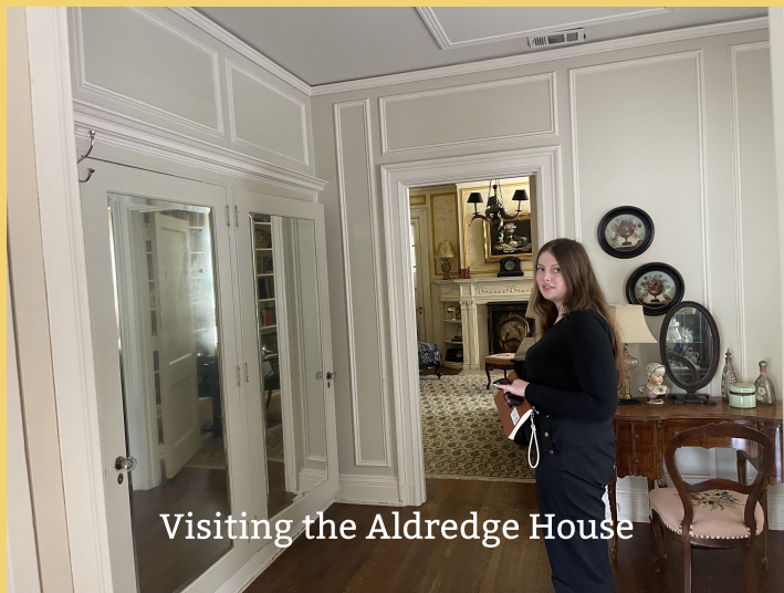
Visiting the Aldredge House