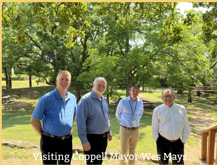
Visiting Coppell Mayor Wes Mays