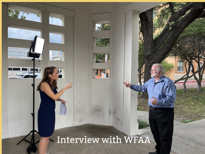
Interview with WFAA