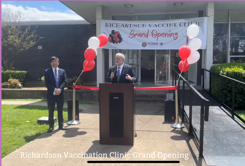
Richardson Vaccination Clinic Grand Opening