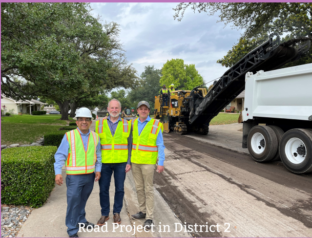
Road Project in District 2