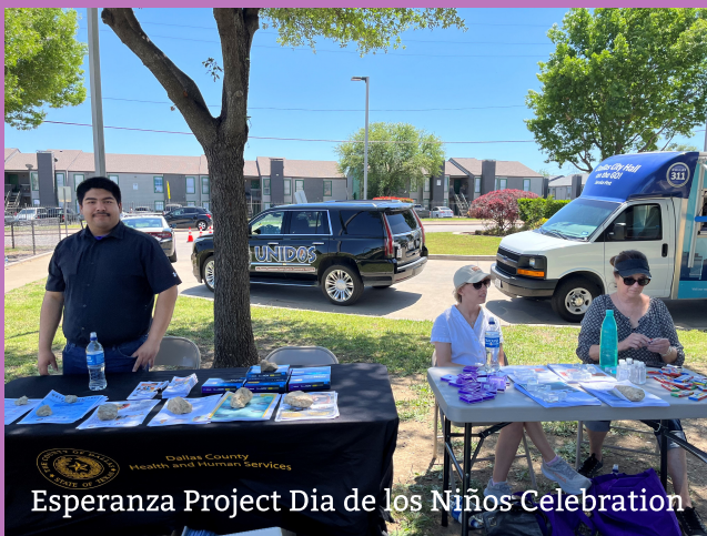
Esperanza Project Dia de los Niños Celebration