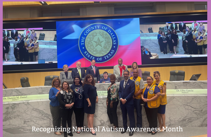
Recognizing National Autism Awareness Month