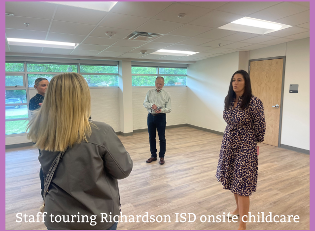
Staff touring Richardson ISD onsite childcare