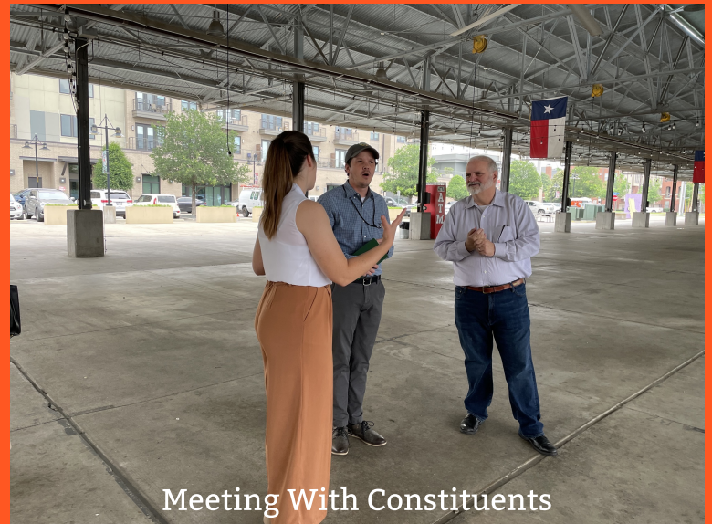
Meeting With Constituents