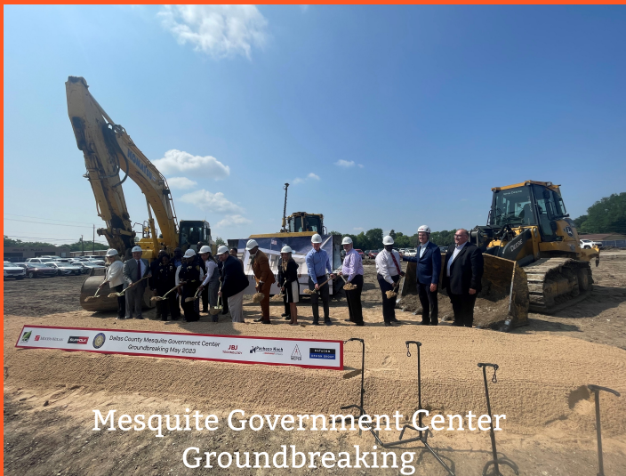
Mesquite Government Center Groundbreaking