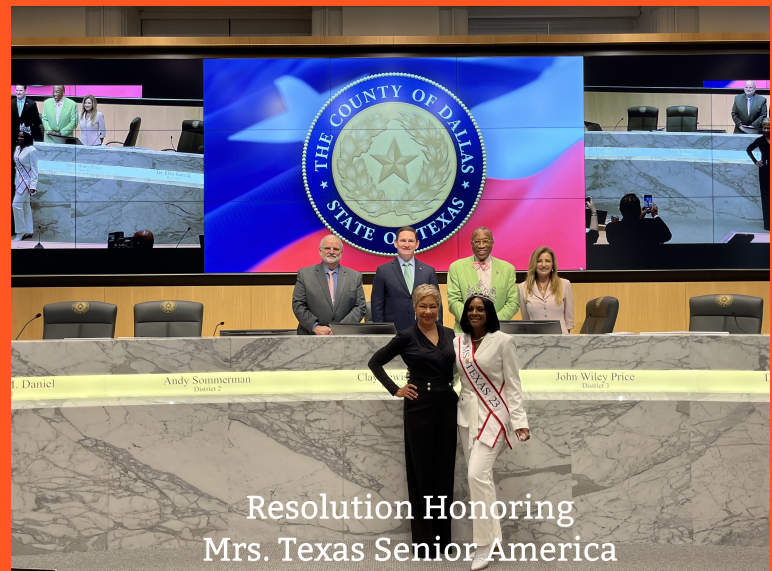
Resolution Honoring Mrs. Texas Senior America