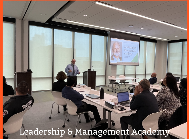
Leadership & Management Academy