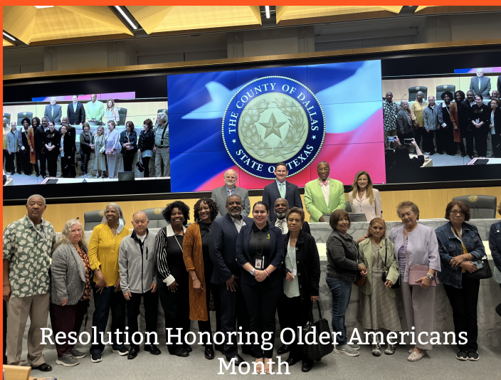
Resolution Honoring Older Americans Month