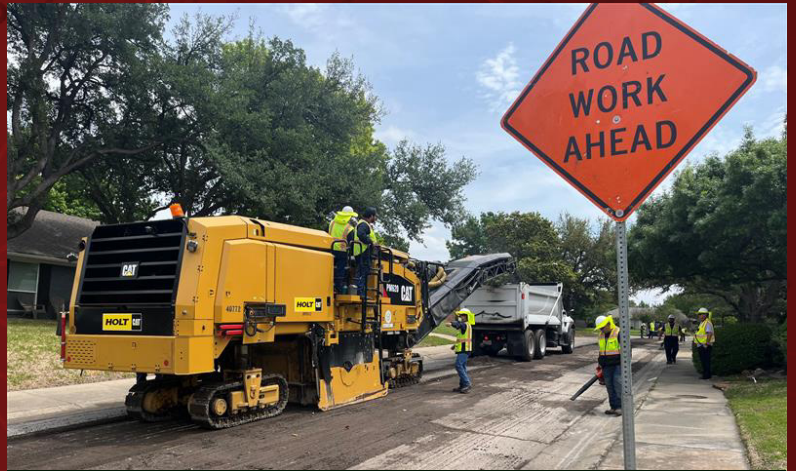
Hard at Work in District 2