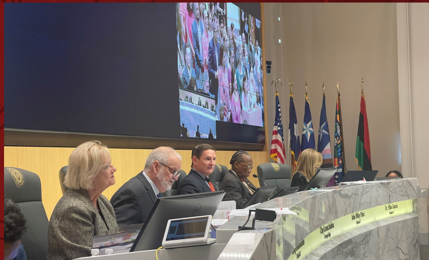
Commissioners Court Meeting on November 7th