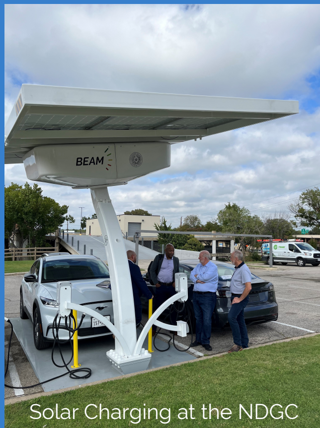
Solar Charging at the NDGC