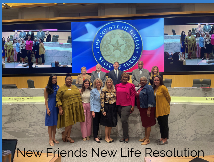
New Friends New Life Resolution