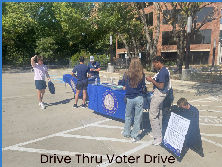
Drive Thru Voter Drive