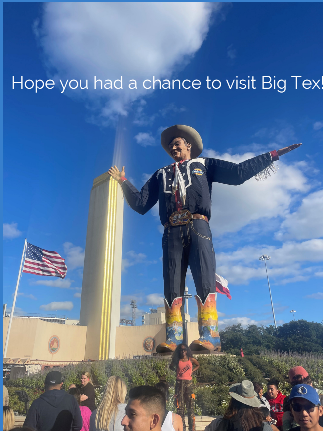
Hope you had a chance to visit Big Tex!