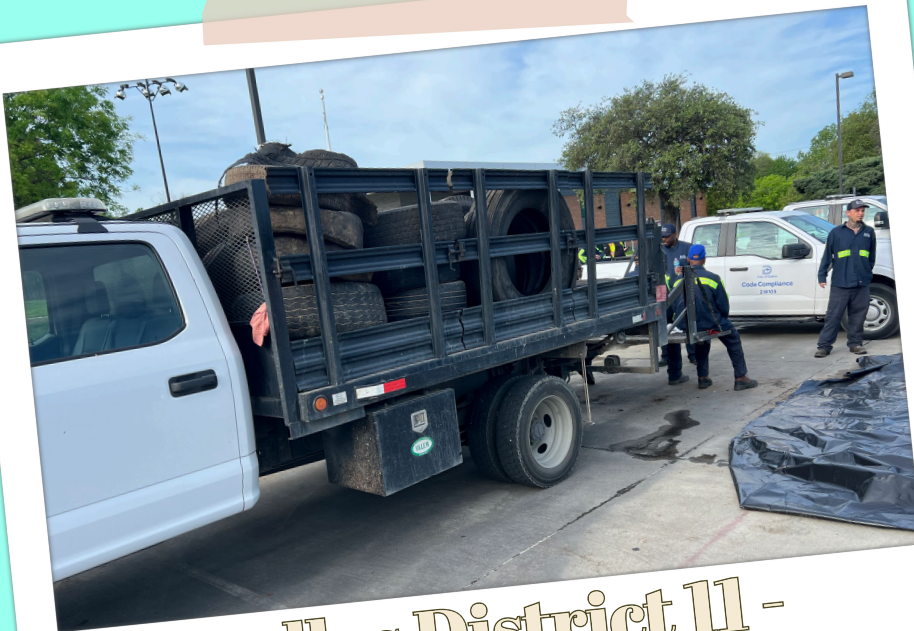
Dallas District 11 - Trash-a-thon 4/13