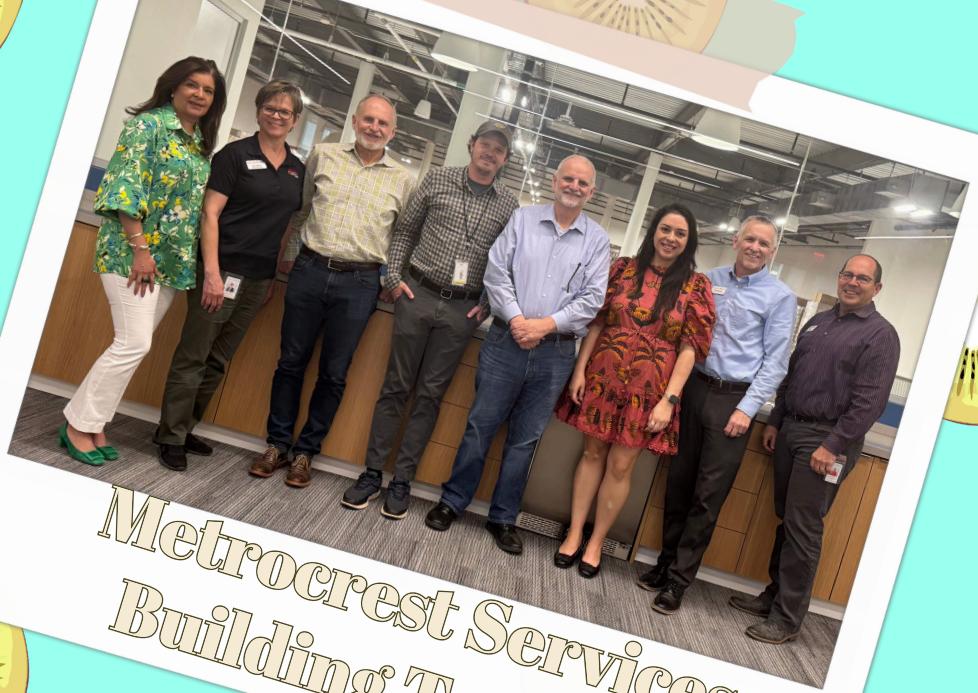
Metrocrest Services Building Tour 4/4