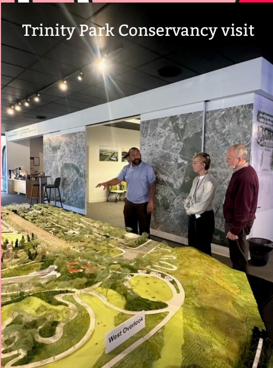
Trinity Park Conservancy visit