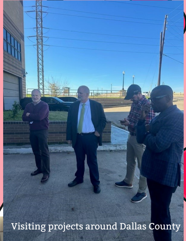
Visiting projects around Dallas County