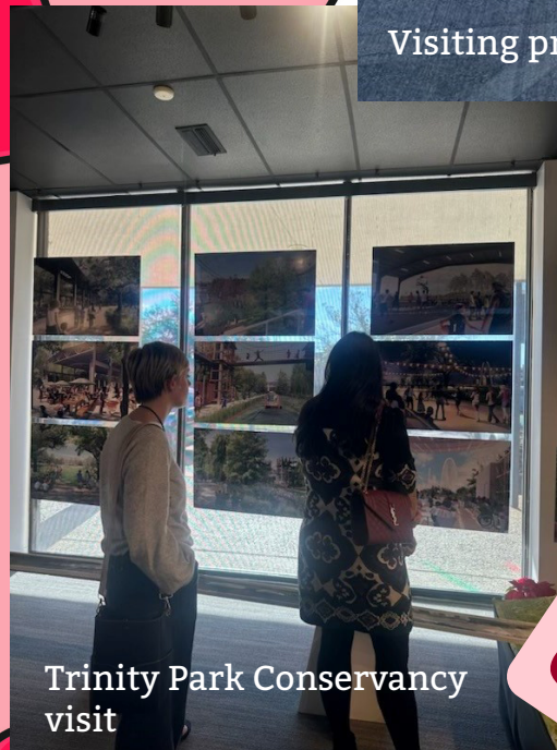
Trinity Park Conservancy visit