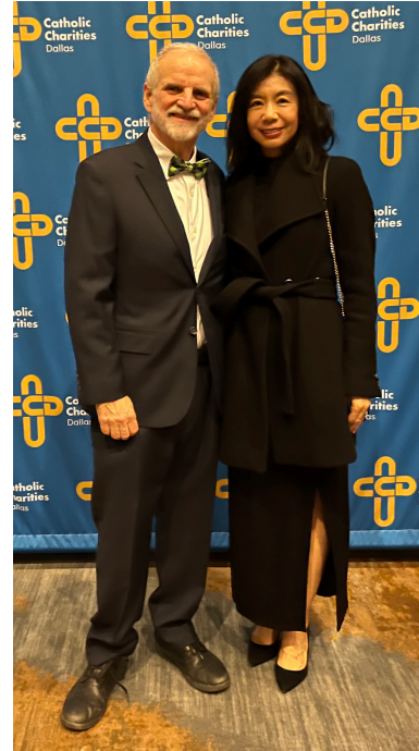
January 25th - Catholic Charities Dallas 27th Annual Bishop's Gala