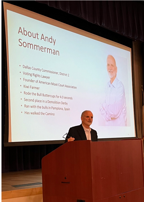
January 16th - Commissioner Sommerman spoke at the Men's Kaffee Klatch.