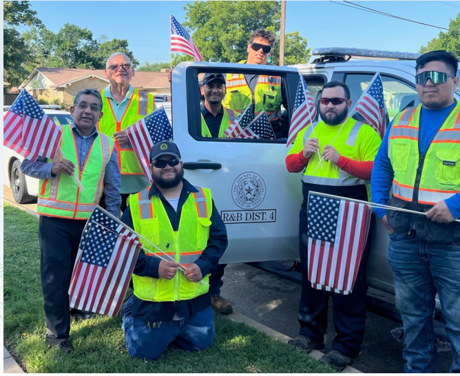
Thank you to my R&B 4 Team for helping The Great Flag Caper of Irving by placing flags for the 4th of July holiday.