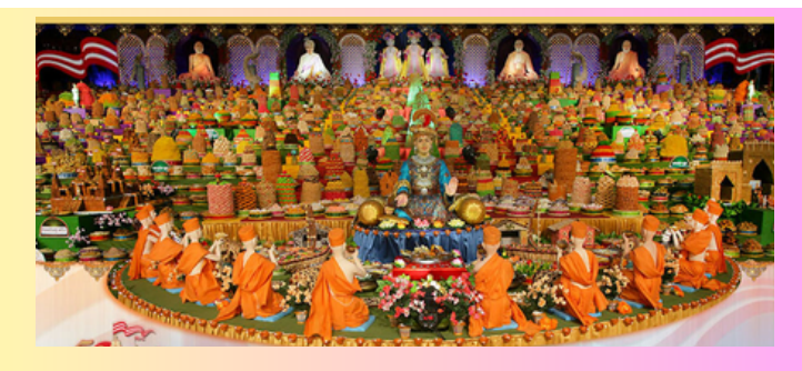
Congratulations to BAPS North America!

Since its inception in 1974, BAPS North America has played a vital role in enriching the lives of countless individuals through its various initiatives, including educational programs, humanitarian efforts and cultural activities. The organization's commitment to promoting peace, harmony and social responsibility has made a significant impact not only within our community, but also across the nation.