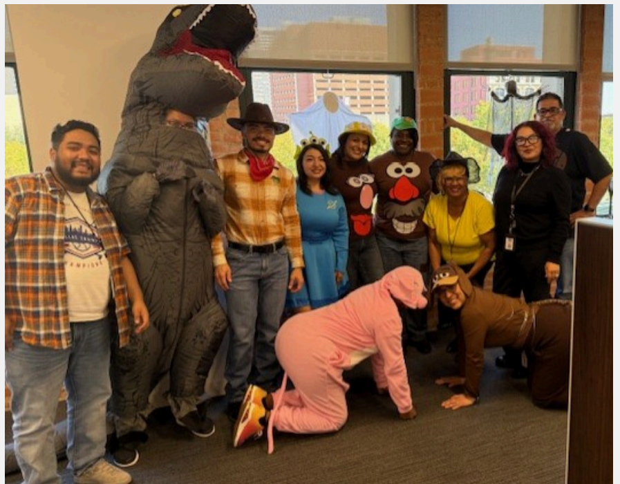
Toy Story - Vitals Division