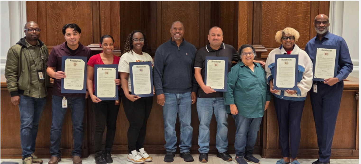
The Dallas County Clerk's Office 2025 Employee of The Year Nominee & The 2025 Employees of The Month. Dallas County Clerk's