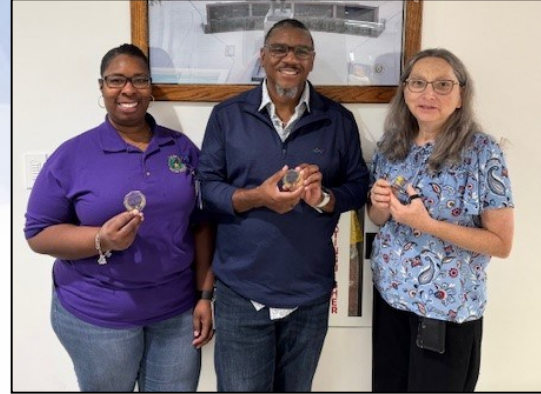
GEM Award Winners