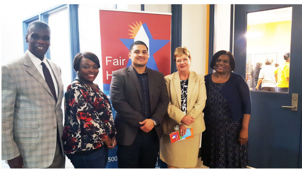
2017 Assessment of Fair Housing meeting at Pleasant Oaks Recreation Center