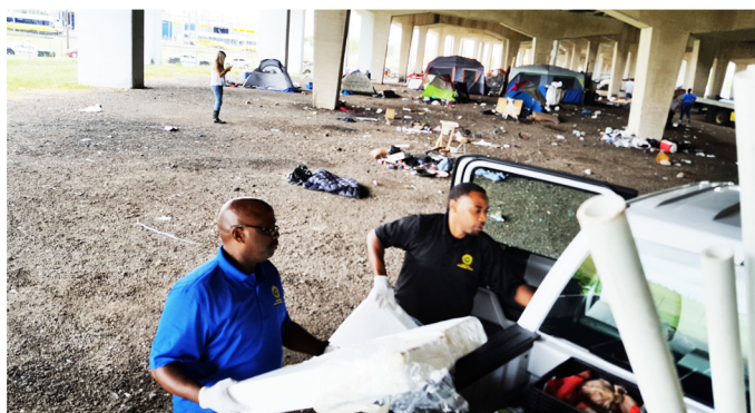
DCHHS Relocating homeless at Second and Third Avenue in Dallas