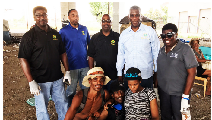
Clients at homeless encampment openly share their story with DCHHS