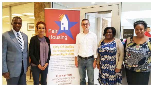
2017 Assessment of Fair Housing meeting at Kidd Springs Recreation Center