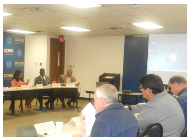
PHAC members discussing legislative updates.