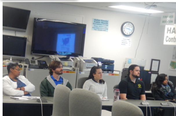
DCHHS staff being briefed on latest Zika Clinical Update