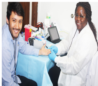
Employee begins his cardiovascular screening.