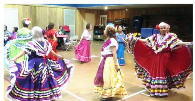
Dancers perform at the Jefferson Senior Center.