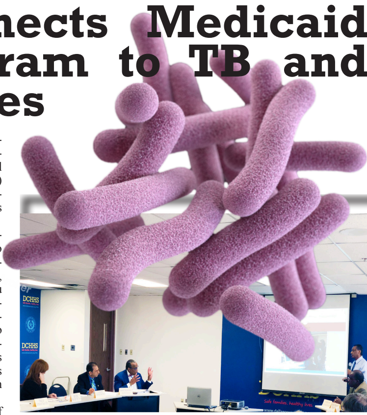
PHAC hears strategic initiatives from Medicare Waiver Program Manager Woldu Ameneshoa.

The supportive role of DCHHS' Medicaid Waiver Program is geared towards education and health promotion, reducing the course of TB treatment, increasing follow up after treatment for syphilis and several measures of expansion for DCHHS immunization, STD and TB clinics. Over the course of implementation of the program's sustainability and expansion plan, DCHHS intends to intensify collaboration with local public, private and non-profit organizations.