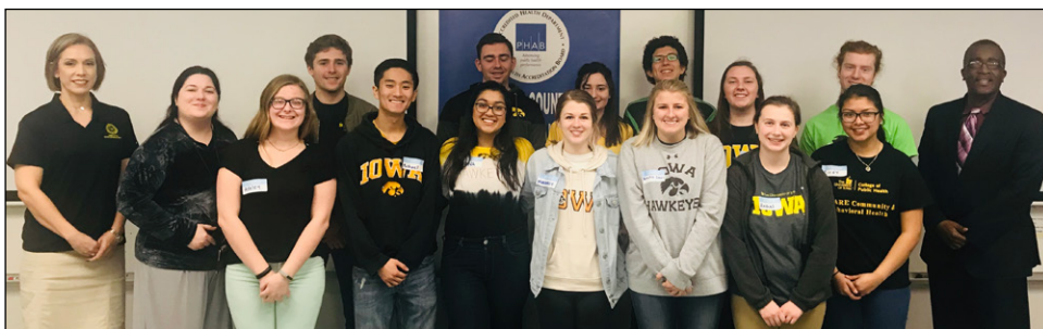
University of Iowa students Hawkeye Service Team