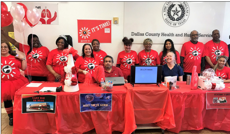
TB Elimination Team brings awareness and education about TB to the community

The TB staff provided information about TB, gave tours of the TB clinic and offered free TB testing in recognition of World TB Day.