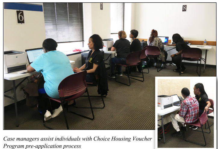
Case managers assist individuals with Choice Housing Voucher Program pre-application process