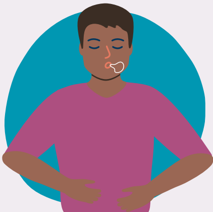
Slow breathing (fewer than 8 breaths per minute)