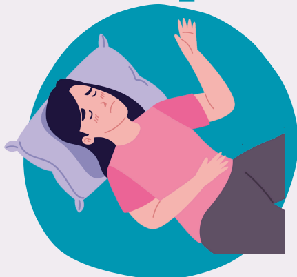
Inability to wake up