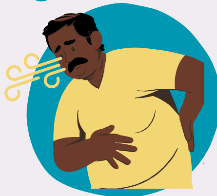
Irregular breathing (10 seconds or more between breaths)