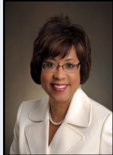
Judge Rhonda Hunter