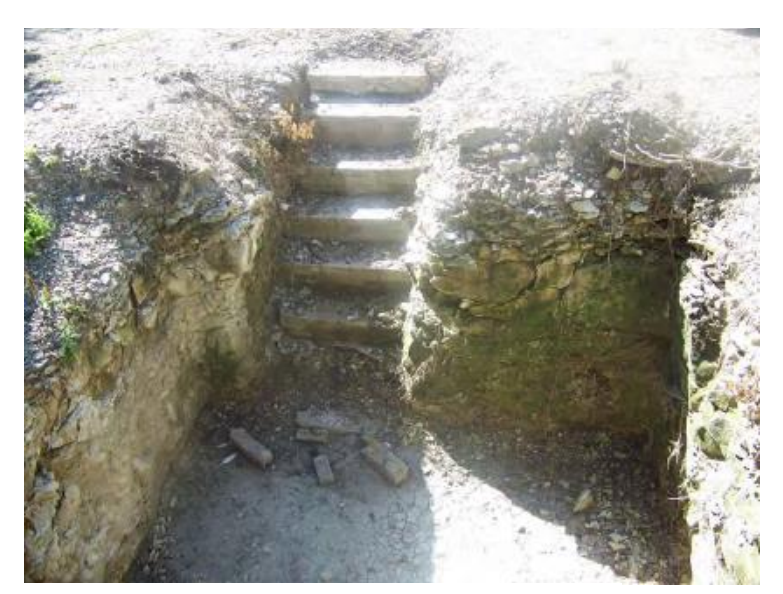
The stairs leading into the root cellar.