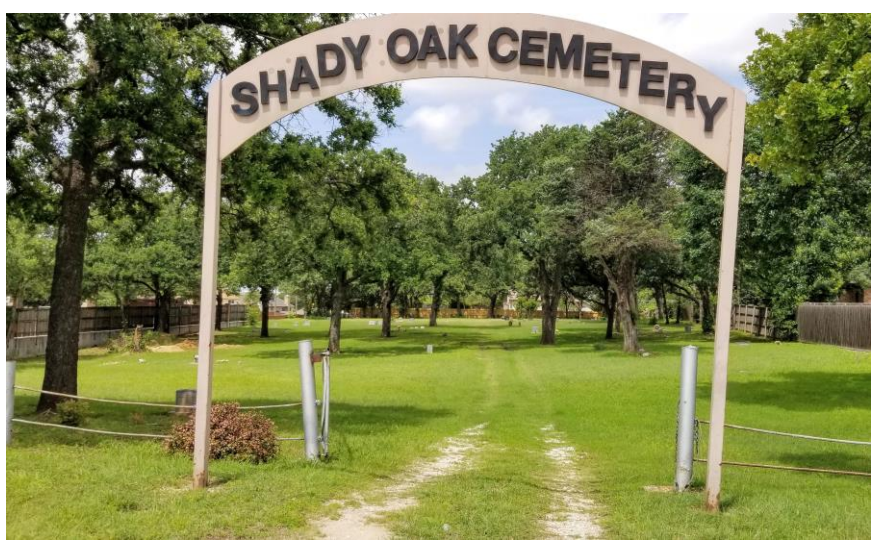
Entrance to the Shady Oak Cemetery, May 2021

As new Dallas County communities were being formed during the early years of our County's history, family members mourned the earthly transition of loved ones with an added stress. New settlements lacked burial sites. It is rare today to hear of the start of a new family cemetery. This was once a common solution where families came together to acquire or set aside land to bury their members. Typically, there was an agreement regarding details such as land purchase or donation, retirement of a loan, maintenance of the burial plot, and family member eligibility for burial.