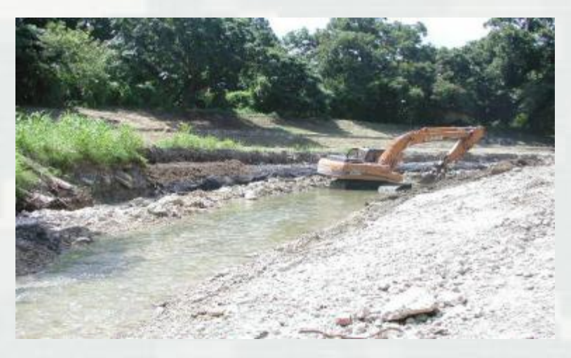
Soil Reinforcement Installation