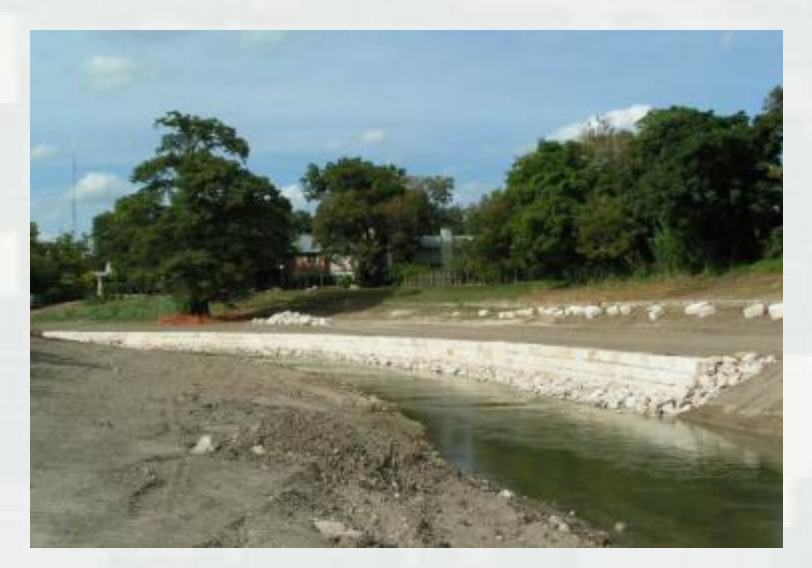
Cut Stone Wall Facing Upstream