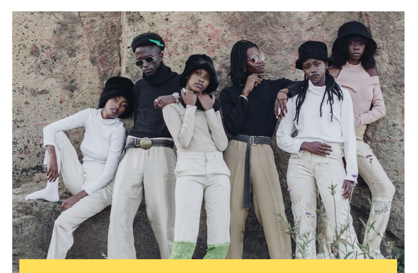
NATIONAL BLACK HIV/AIDS AWARENESS DAY

National Black HIV/AIDS Awareness Day (NBHAAD) is observed annually on February 7 to increase awareness, spark conversations, and highlight the work being done to reduce HIV in Black or African American (hereafter referred to as Black) communities in the United States and show support for people with HIV in these communities.