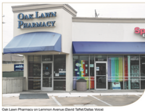
Oak Lawn Pharmacy on Lemmon Avenue

In 2010, the company opened as Pride Pharmacy in an office building on Carlisle Street in Oak Lawn that also housed Uptown Physicians Group. The plan was to locate in buildings with a large HIV medical practice, specialize in HIV medications and also offer a full line of prescription drugs while providing the kind of customer service missing from retail chains. The idea for Pride Pharmacy came when a friend of the original owner said he'd give anything to see his over boxes of Pampers to get to the pharmacist. Instead, customers walked into something more like a living room. And the living room and an adjoining conference room were available to community groups for meetings. That meeting space is returning to Oak Lawn Pharmacy.