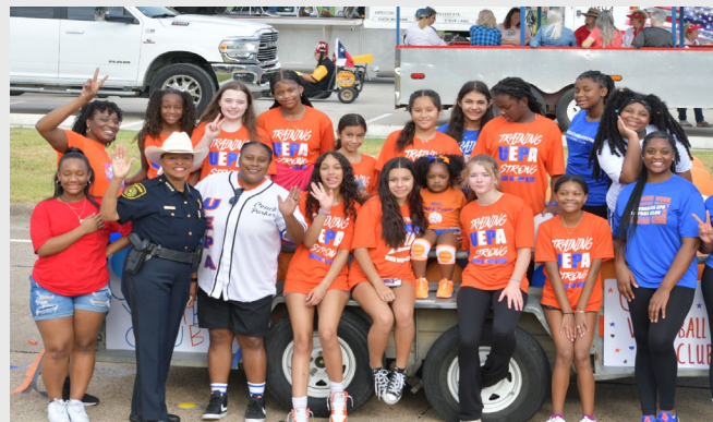
Labor Day parade 2024

During Halloween, staff engaged with the community by hosting Trunk or Treat events for local children. The Sheriff's Office provided gifts to three mobile home park communities during Christmas, bringing joy to hundreds of families. Through our Blue Santa events, over 500 families were served.