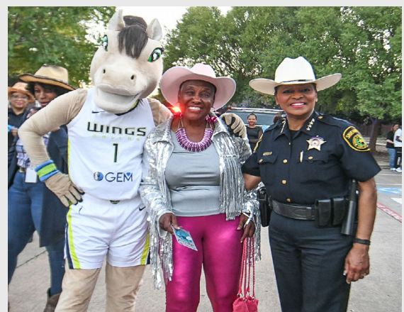
National Night Out - 2024