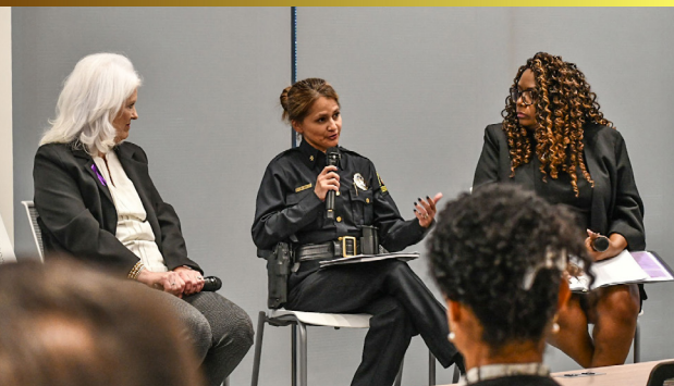
Domestic Abuse Townhall at Genesis Women's Shelter