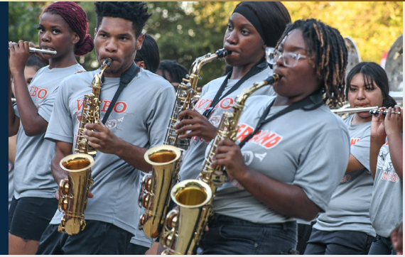
National Night Out 2024

We are committed to building strong partnerships that inspire and uplift our community. By working together, we can create a more promising future for those we serve. To join our efforts, please contact us at community@dallascounty.org