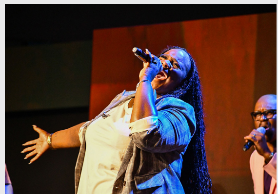
Faith and Blue Church Services