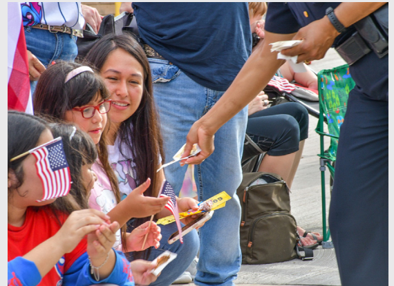
Labor Day Parade 2024